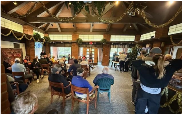
It's time for the ABCD raffle prizes!